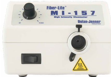
Mi-157 Manual Iris for Precise Color Control