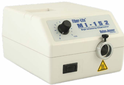
Mi-152 25mm Fiber Interface Accepts all DJ Fibers & Adapters